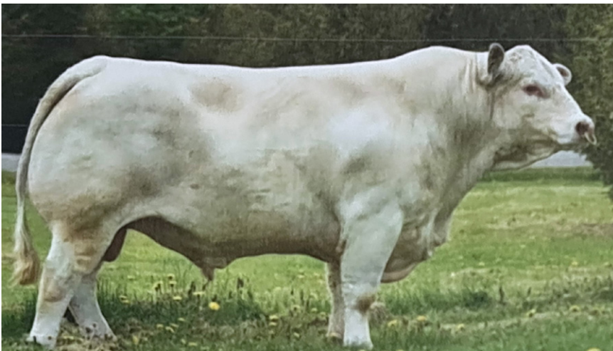
DALMAS CASINO 375C P