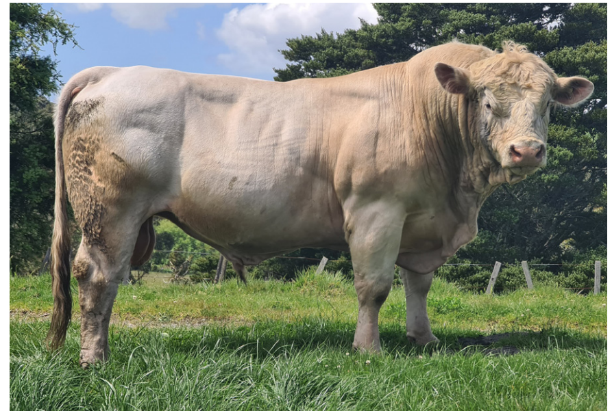
RJC NEWTON N4 SON OF PALGROVE HALLMARK