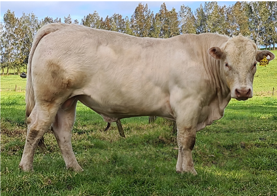
RJC ORDING 035