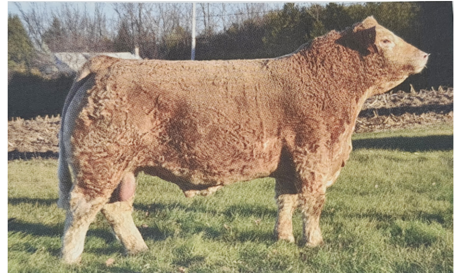
BULLETPROOF 411B P RF AI