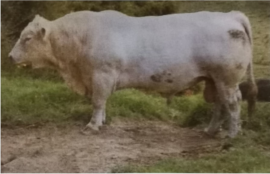
RJC HISLOP H47 SON OF CEDARDALE TYRANT 31T