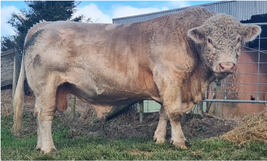
CF P102 PYBOLIN. SON OF SYMBOL