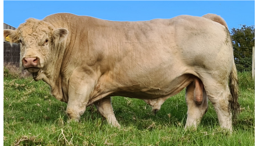
MOONLIGHT NODDY N36 SON OF PALGROVE AWESOME